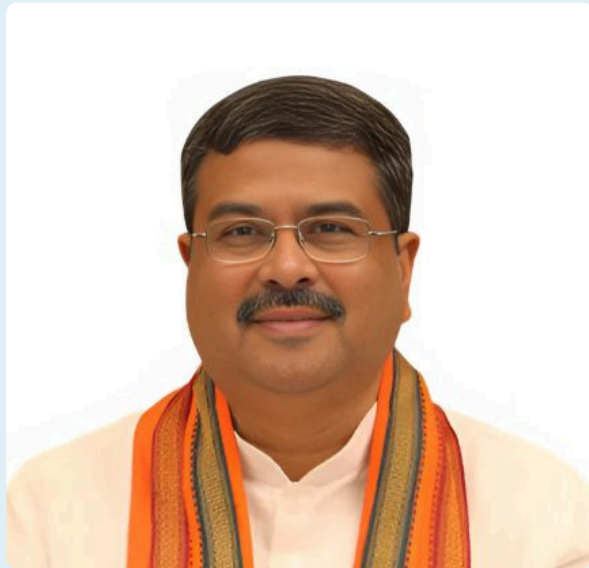
Shri Dharmendra Pradhan

Hon'ble Minister of Education, Government of India