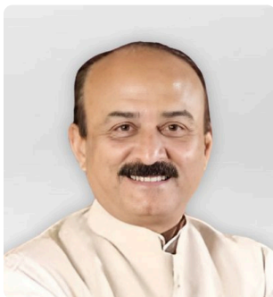
Shri Ashish Sood

Hon'ble Minister of Home, Power, Urban Development, Education, Higher Education and Training & Technical Education, Government of Delhi